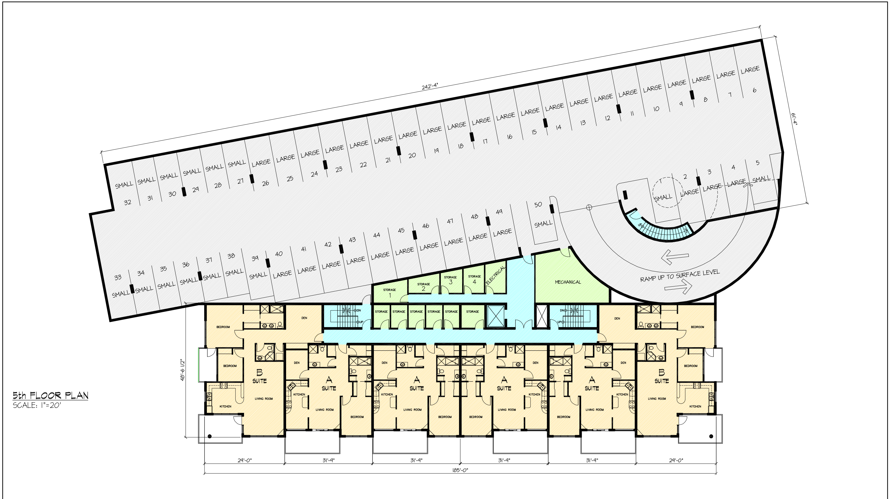
5th FLOOR PLAN SCALE: 1"=20'

NOTE: This drawing as an instrument of service is the property of Robert Boyle Architecture Inc., Architects - Planners and may not be reproduced without their permission and unless the reproduction carries their name. All designs and other information shown on the drawing are for use on the specified project only and shall not be used otherwise without written permission of this office. Written dimensions shall have precedence over scaled dimensions. Contractors shall verify and be responsible for all dimensions and conditions on the job and this office shall be informed of any variations from dimensions and conditions shown on the drawing. Shop drawings shall be submitted to this office for approval before proceeding with fabrication.